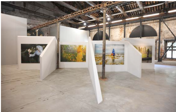
Photo: Installation photography of the UAE Pavilion at the Venice Biennale, 2011