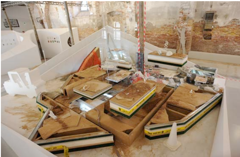
Photo: Installation photography of the UAE Pavilion at the Venice Biennale, 2011 / © seeing things photography