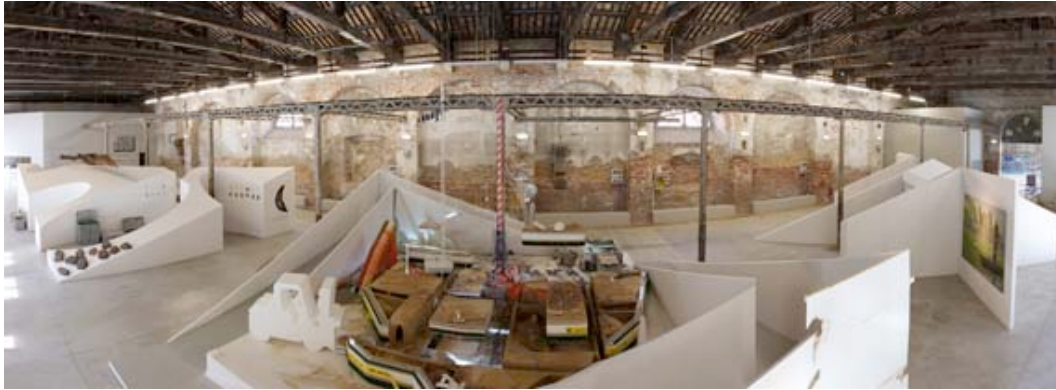
Photo: Installation photography of the UAE Pavilion at the Venice Biennale, 2011 / © seeing things photography