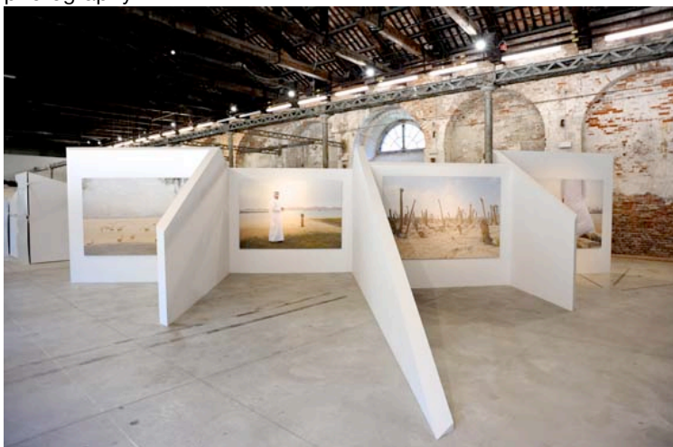
Photo: Installation photography of the UAE Pavilion at the Venice Biennale, 2011