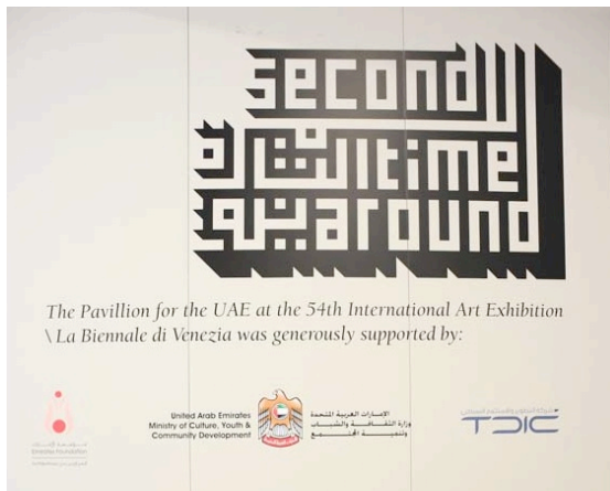
Photo: Installation photography of the UAE Pavilion at the Venice Biennale, 2011

VENICE, ITALY / The Pavilion of the United Arab Emirates at the 54th International Art Exhibition - la Biennale di Venezia features “Second Time Around”. The UAE participates with its second National Pavilion in the Arsenale proudly presenting the work of three Emirati artists to the international community.