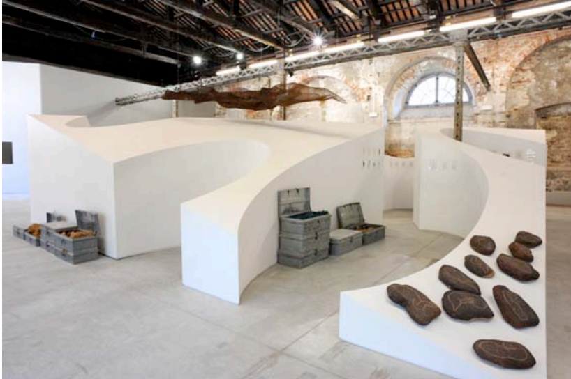
Photo: Installation photography of the UAE Pavilion at the Venice Biennale, 2011