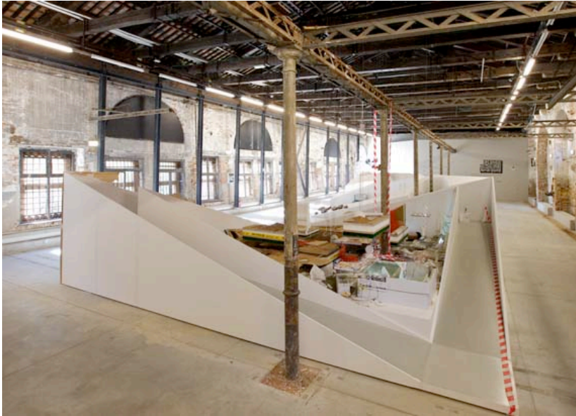
Photo: Installation photography of the UAE Pavilion at the Venice Biennale, 2011