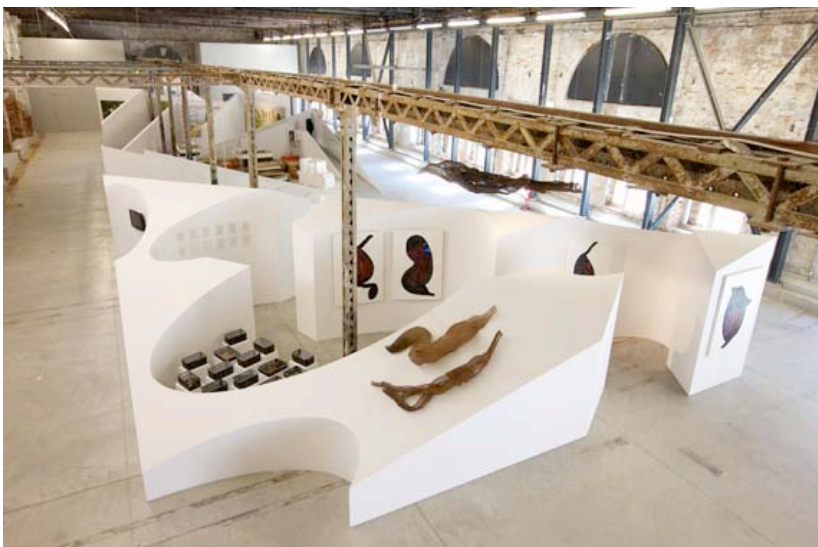
Photo: Installation photography of the UAE Pavilion at the Venice Biennale, 2011